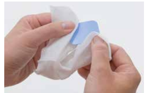
Image plate cleaning wipe

FD 350 disinfectant wipes by Dürr Dental are particularly suitable for the wipe disinfection and cleaning of medical products. Thanks to their size, they are ideal for the cost-effective cleaning of small surfaces and objects: For example, they are suitable for quick use on the sleeves of intraoral plates and films and on handpieces and angle pieces, and they leave no residue.